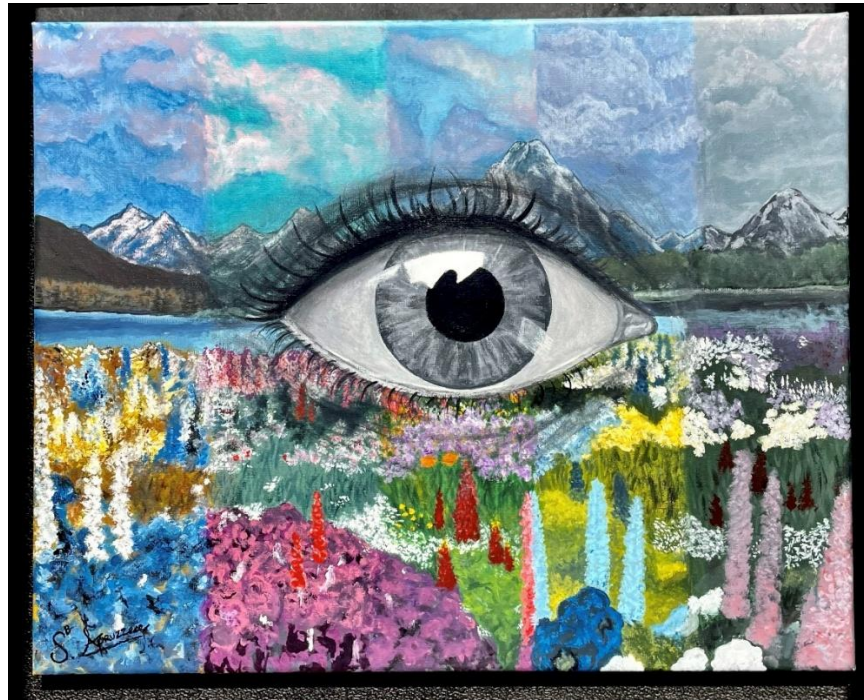
Summer A. Perception In Hues Painting $300

Life is so fast paced, sometimes we can forget to slow down and experience the world around us. Perception varies from person to person, and it can be easy to forget that our perception of the world around us is not the only perspective. In this piece there are 4 different types of colorblindness represented. It depicts how visually impaired people see the world as opposed to non-visually impaired people. We get so used to the world around us that we take such beauty and wonder, like colors for granted. Even though some may see colors differently, that still does not make their world any less beautiful.