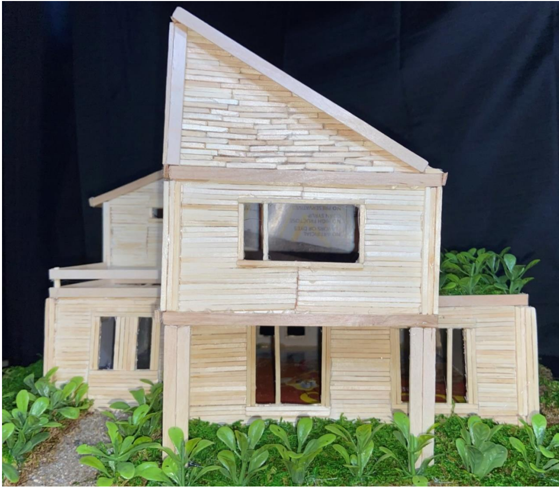
Chelsea Monet Modern Home Dream Sculpture $150

To create this modern home dream I had to first start with the skeleton of the house. I wrote down measurements I wanted for my sculpture. Using those measurements I cut out the panels of my house. After assembling the panels I had the frame of my house ready. I glued down matchsticks for the walls and windows. Skinny sticks were used for the roof, second floor fence, and column in the front of the house. Using moss sheets, I created the lawn as well as the grass portion on the second floor. To complete the final touch synthetic leaves were used to represent bushes and sand was used to create gravel paths. Modern Home Dream is a wooden sculpture that represents a modern home with cabin vibes. The wood selected was chosen due to the flat angles they had, since my sculpture is very angular. I created this design to represent the home I wish to provide for my family one day. I call it a dream because who wouldn't want a spacious home with a second story porch and garden? I've been very passionate about this piece since the beginning, hope you enjoyed it!