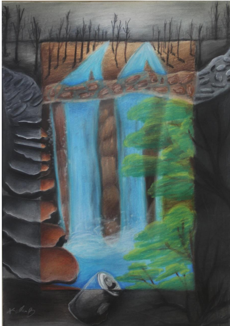
Kalista Bomar A walk of perspective Drawing $175

My piece was made to portray our perspective and walks of life. There are many ways to look at things whether it be positive or negative. I try to be positive and find the good in the situation but sometimes that is not always so easy. The black border is supposed to represent despair and/or death while the middle represents life and/or beauty. We all choose to look at situations differently emphasizing the color pop really shows that. The stone path leading up to the waterfall and also going off into the opposite direction shows how we come upon choices that can lead to such an impact on our life and the paths we choose can affect our scenery. I chose to use pastels because I want to try new things and be able to use anything around me to create. I intend to carry this attitude through my journey as an artist and in life.