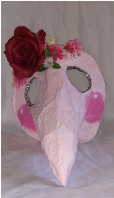
Kylee McGriff Cutesy Plague Doctor Sculpture $200