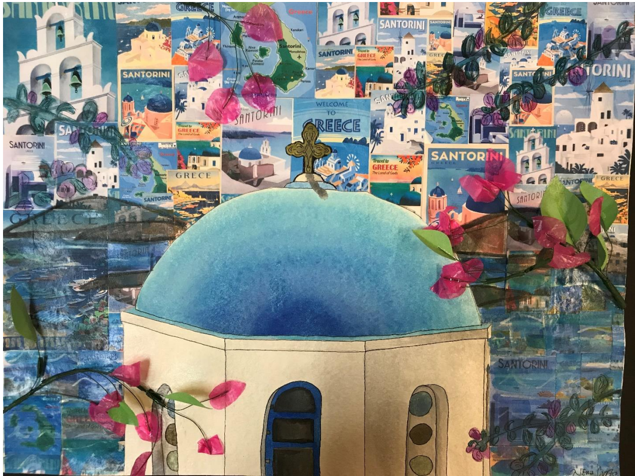
Nina Curto Oia, Santorini Mixed Media $225

In this piece I wanted to explore a sense of place. The blue domed chapels of Santorini's Oia are the village's trademark attraction, often for a destination wedding. I wanted to tie in the tourist vibe by using images from brochures to create repetition in the background. The magenta of the handmade 3D bouganvillas next to the blue of the watercolor dome creates a romantic atmosphere. I also layered watercolor on top of the collage to create scenery and dimension. My inspiration for this piece comes from my Greek background, a cultural theme I often return to in my art. I also frequently create pieces in mixed media because it gives me an expanded arena to convey an idea or concept. I am currently a senior at South Fork and I plan to attend Florida State University in the Fall to major in Psychology for my undergraduate degree and then go back for my masters in Art Therapy. I love making art and seeing how it effects others. I chose this career path so I can help people while still tapping into my personal interests.