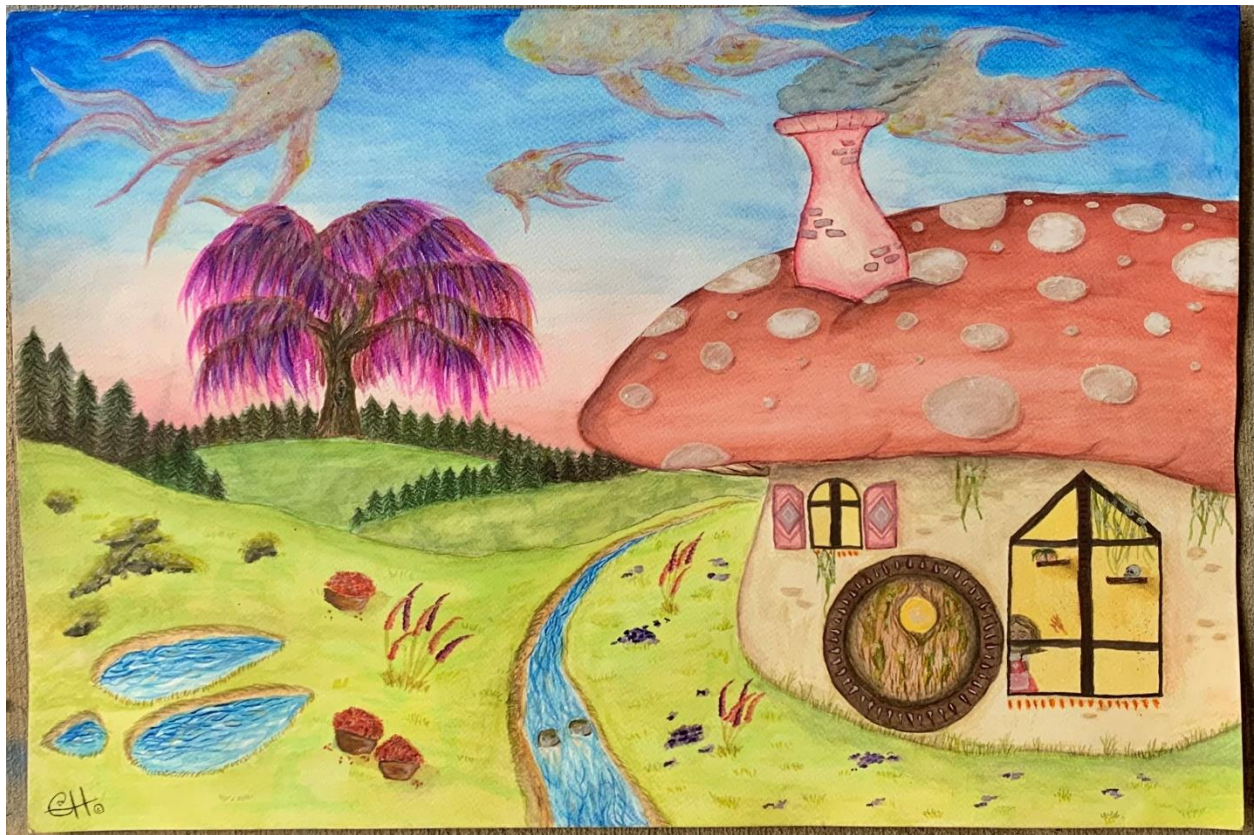
Grace Hulen Not Your Nowhereland Painting $200

I've always had the feeling of having nostalgia and not knowing where you know the picture from. In this piece, it is filled with different parts of imagination. I also added some creepy nostalgia, with the old, psychotic woman, with a blood hand mark splattered on the wall. I love that dark sides of children stories, like the Grimm's stories, with a hint of dark and magical visions.