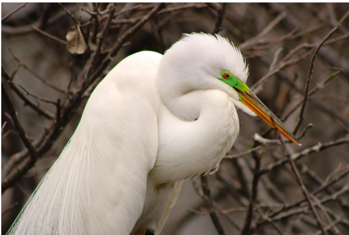
Matt Vogel The Great Egret Photography $200

It was a sunny Sunday afternoon, and I was walking through the Wakodahatchee Wetlands in search of some interesting birds to capture. Towards the end of my journey, I saw a Great Egret balancing on a branch in a big bush. I wanted to capture this image to portray the beautiful bird with a simple background that contrasts its bright feathers. The green pigmentation demonstrates the breeding season for these birds; it is usually a vibrant color to fill the role of attracting mates. I edited the pigmentation around the eye and the feathers to create contrast and emphasize the vibrance of these beautiful birds.