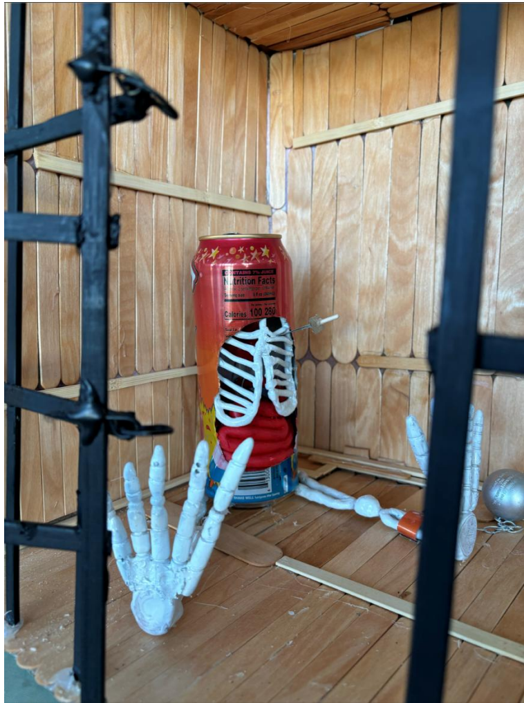
Taj Mastin The Delicious Prisoner Sculpture $300

Delicious Prisoner explores the intersection of consumer culture and human anatomy through a surreallens. By combining the familiar imagery of a beverage can with unexpected anatomical elements, such as a visible heart and ribcage pierced by a sword, I aim to provoke contemplation on themes of consumption and bodily integrity. The skeletal legs attached to a shackle further symbolize themes of restraint and captivity within the context of desire and consumption. Through this piece, I invite viewers to question the difference between external appearances and internal realities, challenging them to consider the hidden complexities beneath everyday objects. Ultimately, "The Delicious Prisoner" serves as a visual metaphor for the intricate relationship between consumerism, identity, and the human condition.