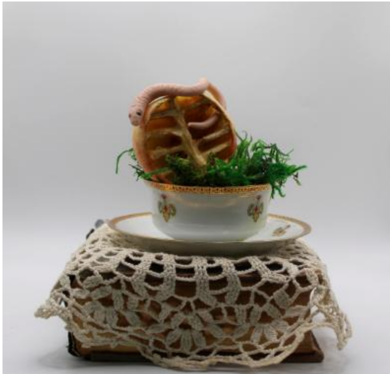
Addison B. The Beginning of Women Sculpture $500

To explore the apple's symbolism in religious narratives, I carved a rib cage into an apple with a missing rib. This references the biblical story of Adam and Eve, where Eve, tempted by the serpent, broke God's trust by eating the forbidden fruit. The missing rib alludes to Eve's creation from Adam's rib, symbolizing the rupture in divine order. The apple, beautiful yet marred, becomes a metaphor for temptation, loss of innocence, and human choice. To center the piece around femininity, I added a doily and teacup atop a Bible, connecting the concepts of domesticity, womanhood, and divine transgression.