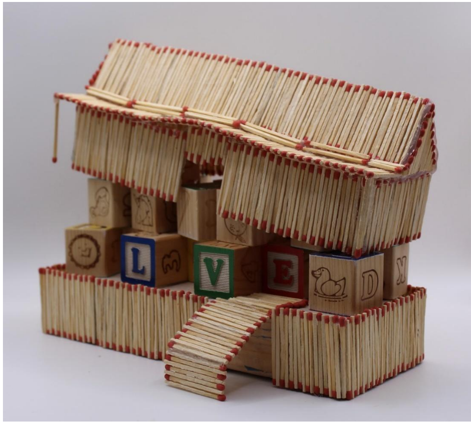
Sofia M. Shaky Foundation Sculpture $400

This piece shows how fragile a home can be when it's built on shaky foundations, represented by the delicate matchstick structure. But even though the home seems unstable, it's held together by the power of love at its center. The blocks with the word "LOVE" stand out as a reminder that even in the middle of chaos and imperfection, love can be a strong force that keeps everything from falling apart. The crooked roof and uneven walls show that life isn't always perfect. No matter how unsteady things seem, the bond of human connection helps people push through hard times and stay strong together.