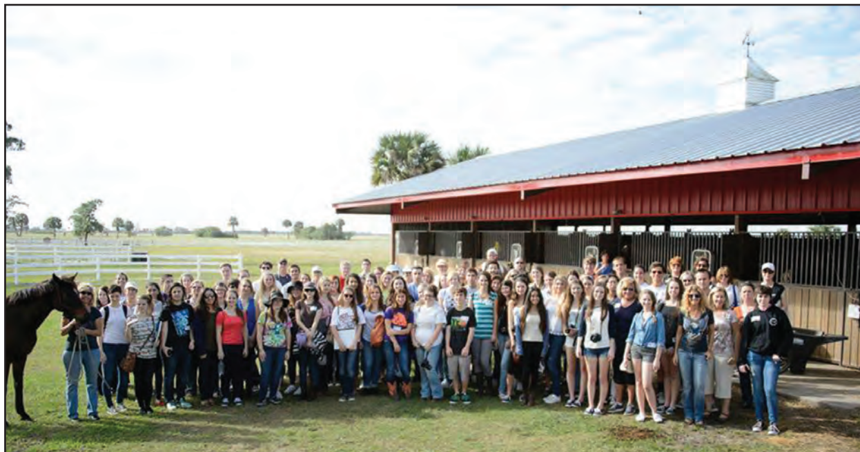
Martin County students and teachers, and Arts Council volunteers, enjoying the Plein Air experience at Sunlight Ranch in 2014.