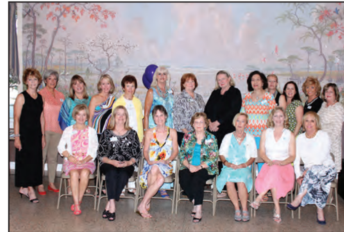
Women Supporting the Arts Spring 2014 reception.