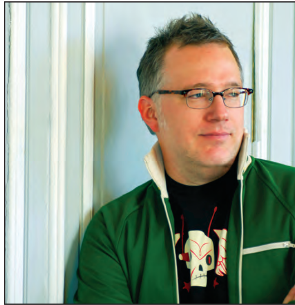
Tony DiTerlizzi, Caldecott Award-winning illustrator and author, is the much anticipated presenter May 14th.