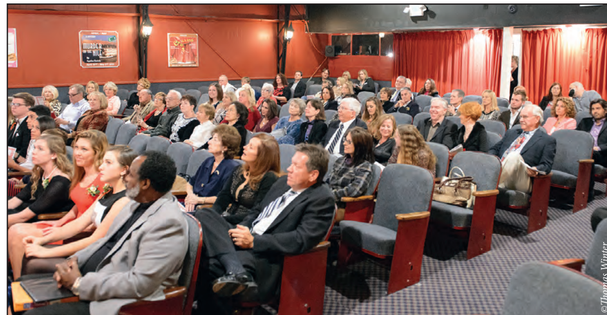
The appreciative crowd at the mARTies Awards in the Barn Theatre.