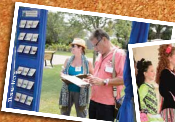
Judges (left) examine artist's work, while Irish Step Dancers from FADC entertain at ArtsFest 2013