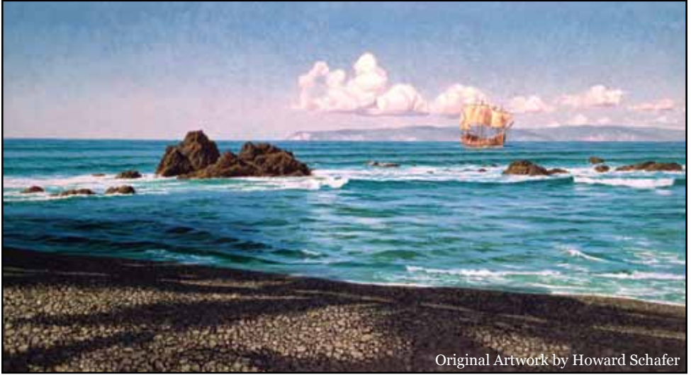
Original Artwork by Howard Schafer

is a collaborative Juried Art Exhibition co-sponsored by the Arts Council of Martin County and the new Elliott Museum that will feature Florida-inspired artwork from September 20 th – October 26 th , 2013.